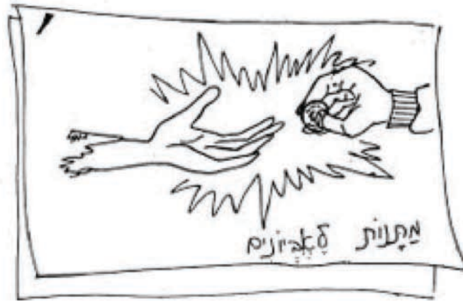
donner de l'argent aux pauvres