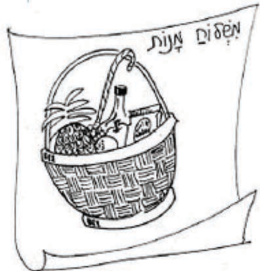
offrir de la nourriture